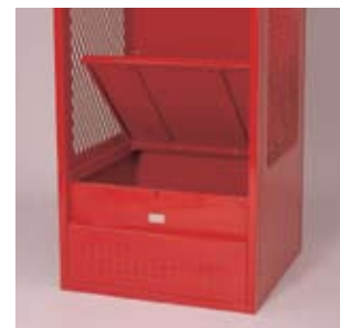
Footlocker Doubles as Seat and Storage Locker

FOOTLOCKER: Front footlocker panel includes single point latch with padlock strike plate and mini louvers. Footlocker top has a continuous hinge. Opening and closing is quieted by rubber bumpers mounted to the contact points. Seat is strengthened with two reinforcement channels welded to bottom of seat. Two side seat supports are fastened to side panels and inserted in a support tab on the front locker panel for added strength.