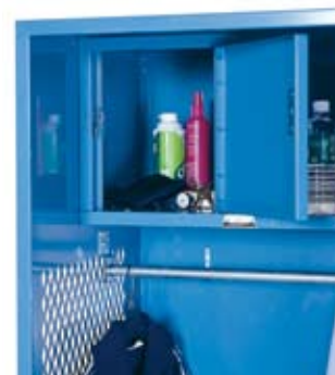
Locking Security Box

SECURITY BOX: 14 gauge lockable door with a 16 gauge side panel. The door is attached to a welded frame with a continuous hinge. The hinge is mounted to door with aluminum rivets. The door is locked with a single point latch by a padlock or built in lock. A lock hole cover plate shall be provided for use with padlocks. Security box door frame members to be not less than 16 gauge formed to a channel shape. Vertical members to have an additional flange to provide a continuous door strike. Intermembering parts to be mortised and tenoned and electrically welded together in a rigid assembly capable of resisting strains.